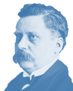
Prof. Alfred Werner Nobel Laureate 1913