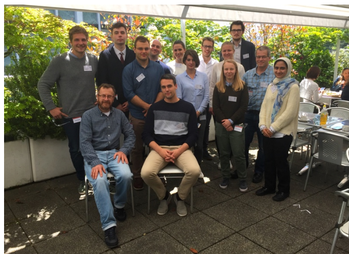
Coffee break on the terrace of the cafeteria