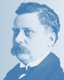
Alfred Werner, Nobel Laureate 1913