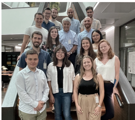
Meet & Greet event at the Givaudan Innovation Campus

Besides getting access to high level education, the scholars also receive support for their integration in our community. Networks such as the young Swiss Chemical Society or Women in Swiss Chemistry invite the scholars to actively participate in their programs. The companies supporting the program regularly invite the scholars to visit (Meet&Greet Program).